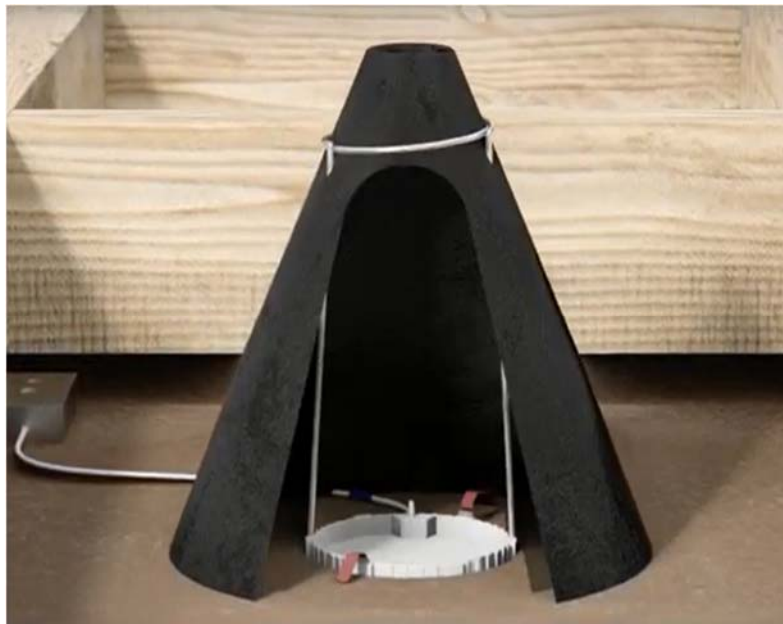
Figure 2. FF109-200 with Bronze Wire – Installation Example with LED fixture

Consult the listing report on the Directory of Building Products ( https://bpdirectory.intertek.com ) for the edition of the standard(s) evaluated.